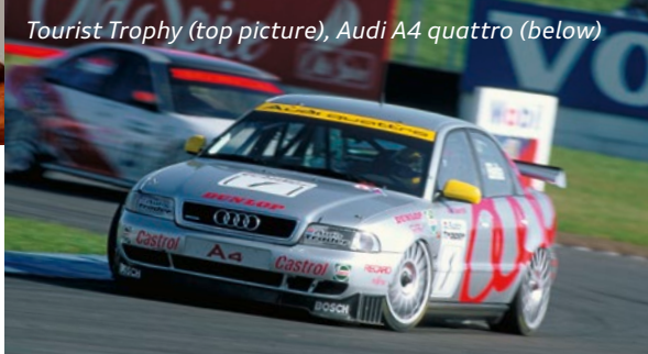
Tourist Trophy (top picture), Audi A4 quattro (below)