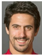
Lucas di Grassi

Date of birth: 11 August 1984 Place of residence: Monaco (MC) Career highlights: 2003 2nd in South American Formula 3 Championship, 2004 3rd in Macau GP, 2005 1st in Macau GP, 3rd in Formula 3 Euro Series, 2007 2nd in GP2 Series, 2008 & 2009 3rd in GP2 Series, 2013 3rd in 24h Le Mans, 2014 2nd in 24h Le Mans, 2015 3rd in FIA Formula E, 2016 2nd in FIA Formula E, 2nd in FIA WEC, 3rd in 24h Le Mans, 2017 1st in FIA Formula E